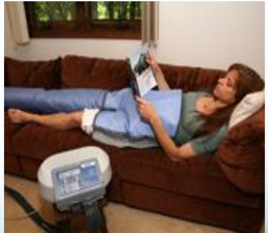
Lymphapress Optimal® Model 1201